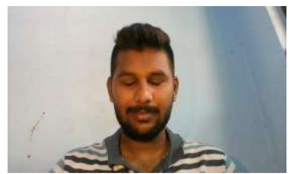
Figure 4.4: Successful Authentication-Test Case2