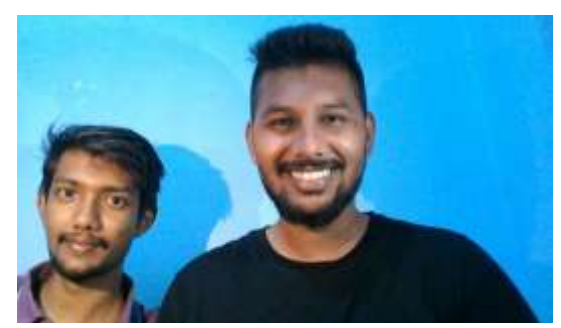
Figure 4.2: FaceRecognition-Test Case 2

On the other hand, the authentication module takes the live videostreamasinput. The different testcases for this module are: