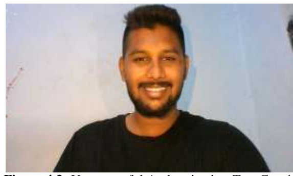
Figure 4.3: Unsuccessful Authentication-Test Case1

fixed duration is detected as an unauthorized person thus preventing spoof attacks. The live video stream is run for certain time period for user authentication. Referring to Figure 4.3, if the person does not blink his eyes with in the given time period it will be detected as "Blink not detected" thus ca using the authentication of that user to fail. The Eyes closed test case is tested with live video stream where the live face with closed eyes for a fixed duration will be detected as an authorized person. The live video stream will run for a certain time period in order to authenticate the user. Referring to Figure 4.4 if the person blinks his eyes with in the given time period it will be detected as "Authentication successful". The eye-blink detection method counts eye blinks in the video stream using the 68- facial and marks method. This method uses a metric called Eye Aspect Ratio (EAR) which is the ratio of vertical distance to the horizontal distance. This metricis used to count the number of eye blinks in the video stream. The blink count is then used to determine the live lines of the user thus preventing spoofing.